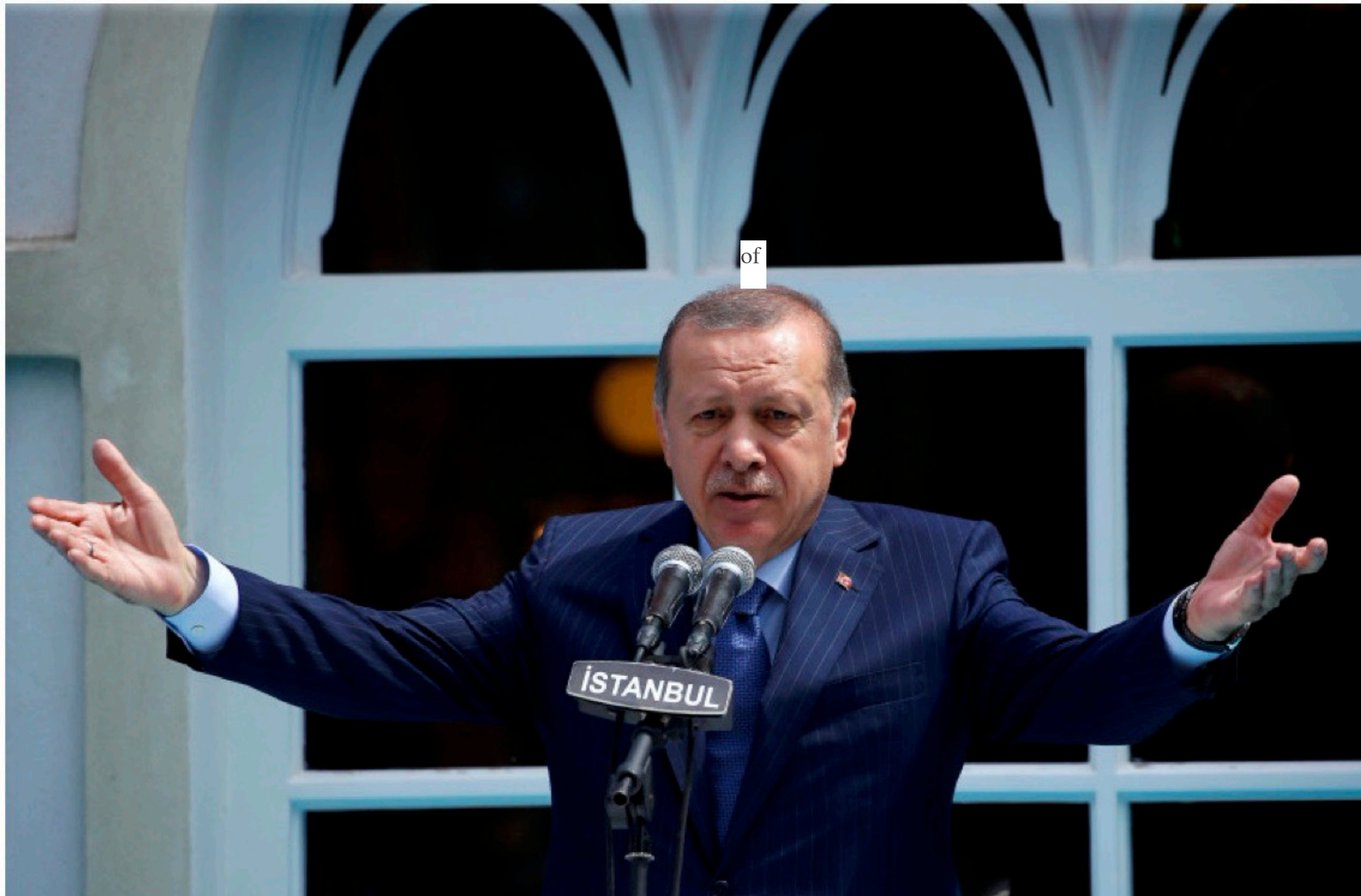
Turkish President Tayyip Erdogan makes a speech during the re-opening of the Ottoman-era Yildiz Hamidiye mosque in Istanbul, Turkey, August 4, 2017