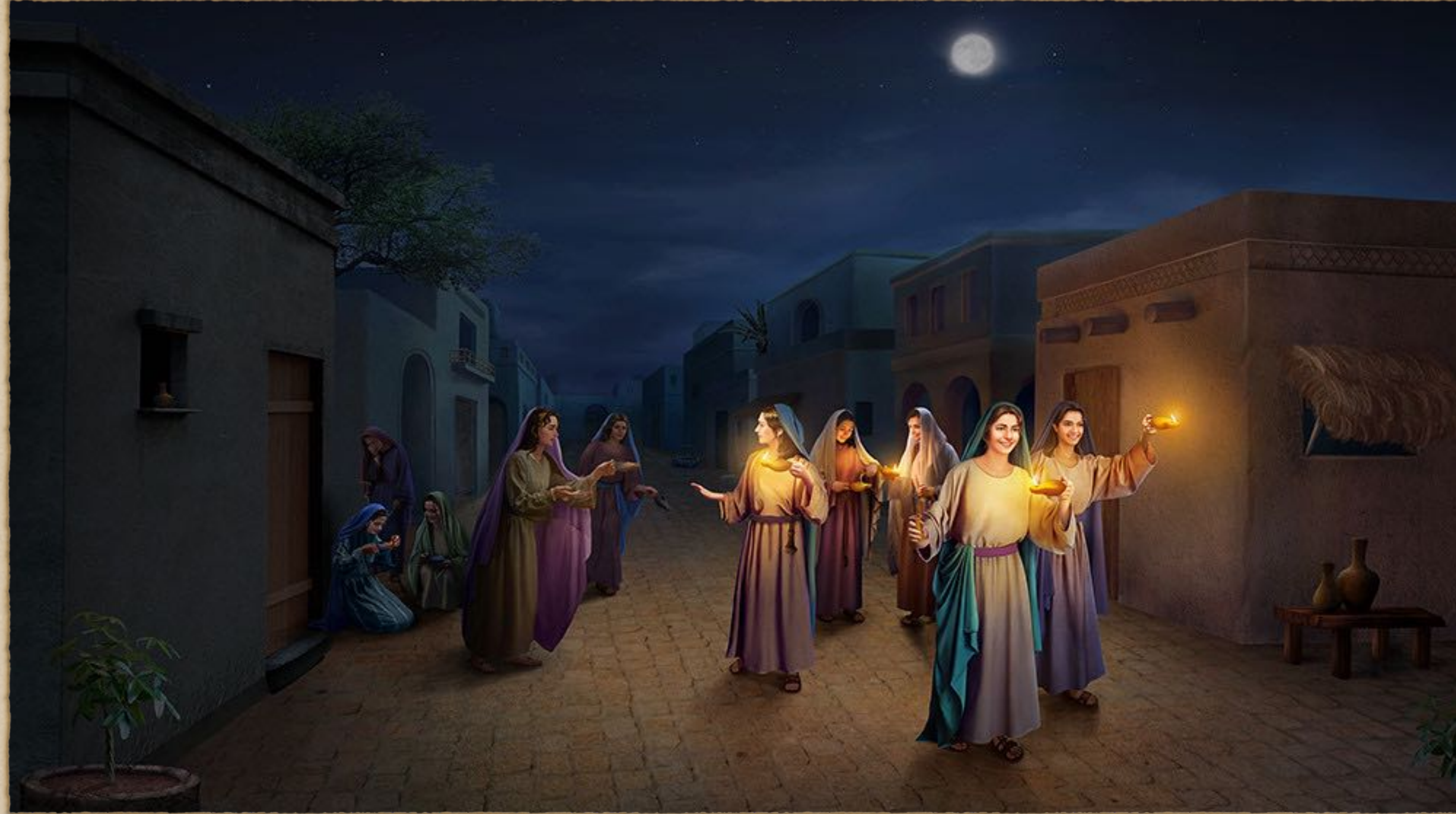
Wise virgins with oil in their lamps