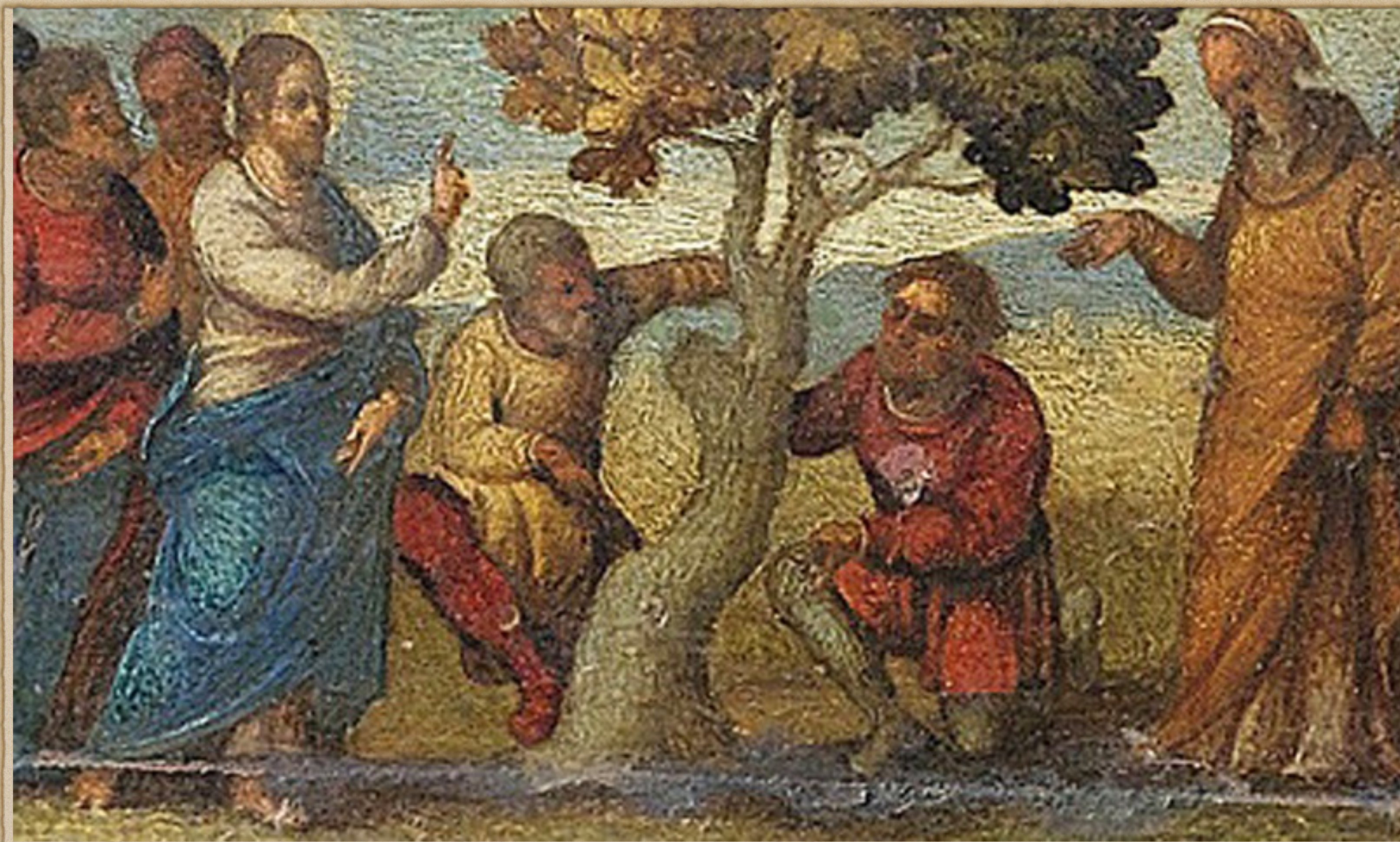
Parable of the Fig Tree